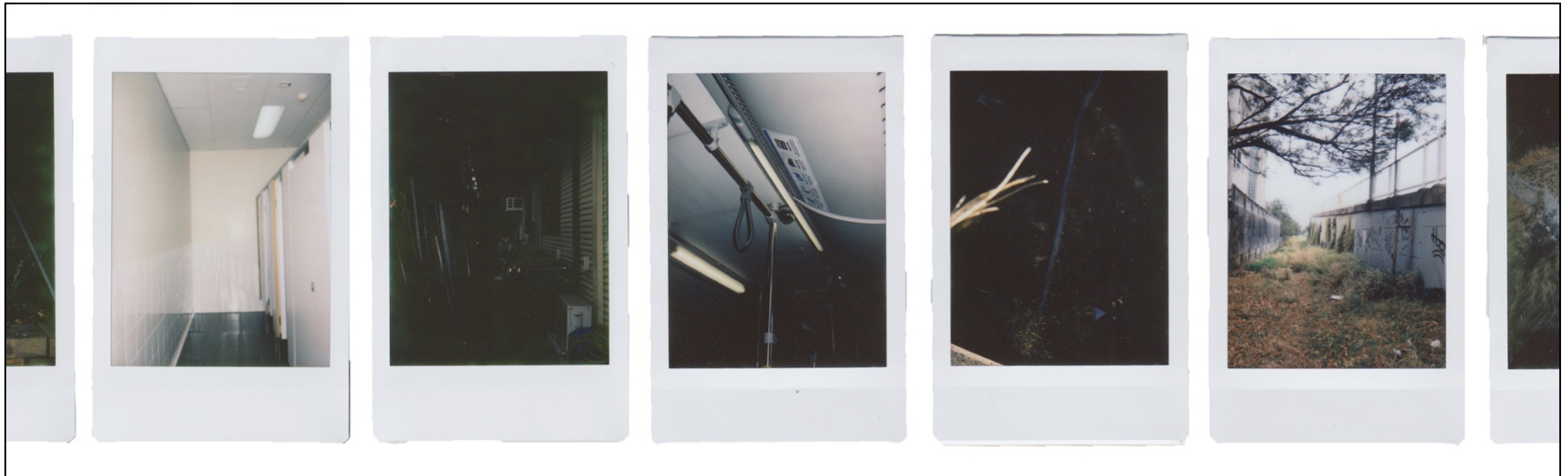
11 Instax Polaroid Prints

Everybody has their own story, something they remember and look back on and say, 'that defines my life'. However, behind these stories or memories that we hold so close to us, a haunting feeling of loss can be recognised. This series aims to capture a different side of the story.