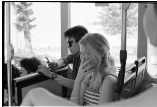
Figure 1.7 Streets & Buses